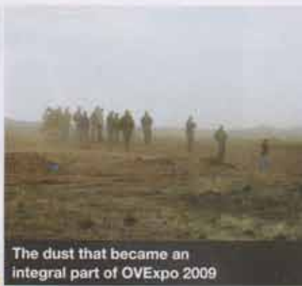
The dust that became an integral part of OVE expo 2009