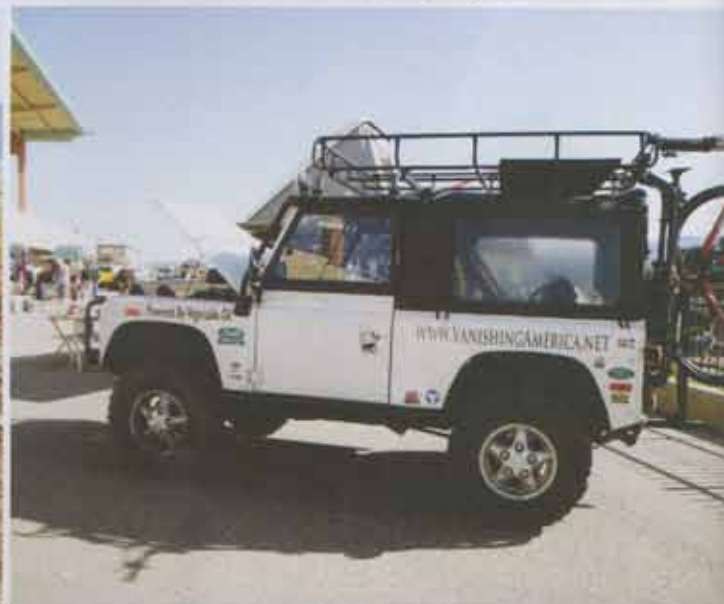
Holt Webb's Defender 90 that runs purely on veggie oil