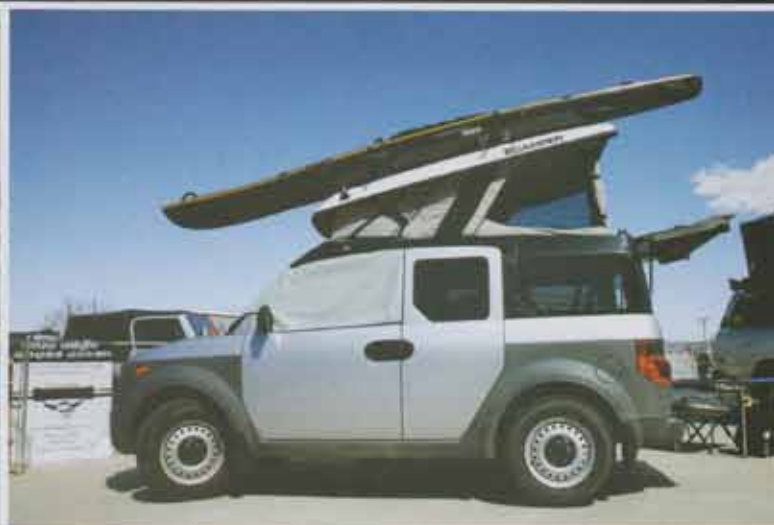
Ursa Minor's Ecamper based on the Honda Element – a versatile improvement on an already substantial vehicle