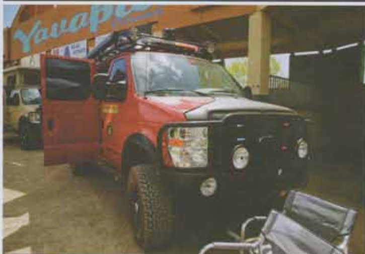
Alan Feld's personal custom-made Search and Rescue Sportsmobile