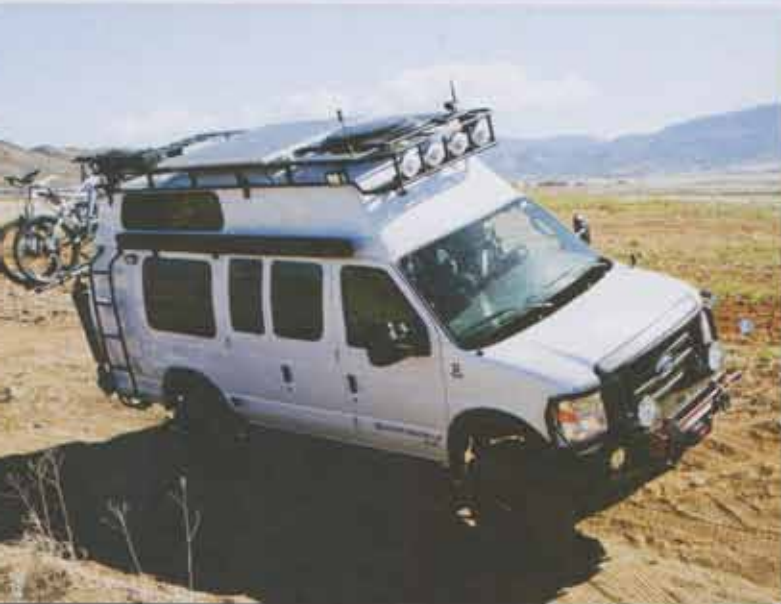
A fully-loaded Sportsmobile on the off-road driving track